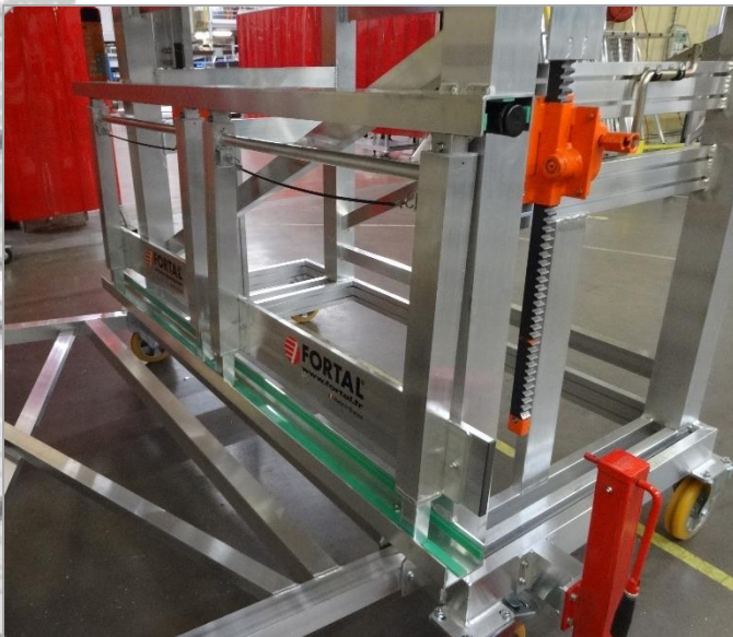
View on rack winch system for variable angle staircase and immobilization cranks.