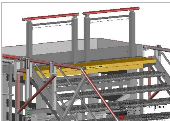
2 removable guardrails and half sliding on the top of access staircase (operator security) storable under the platform.