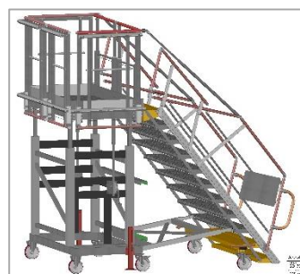
Stepladder in height position

Mobile stepladder for emergency slide access in raw extruded aluminum 100 x 30 mm