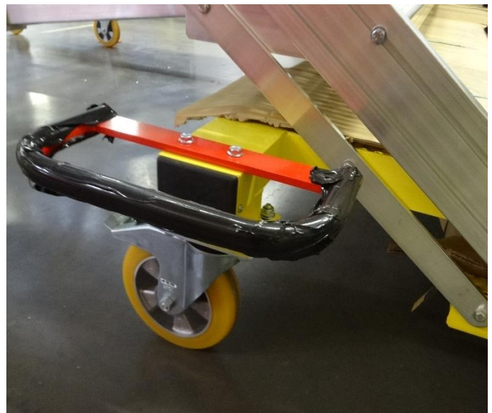
Ø 200mm swivel wheels with brakes at the front and sides and fixed at the rear Polyurethane tyres (for workshop or outside) with curving profile for easier moving.